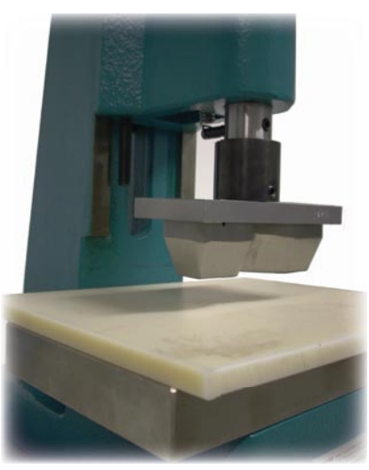
Manual Specimen Punch