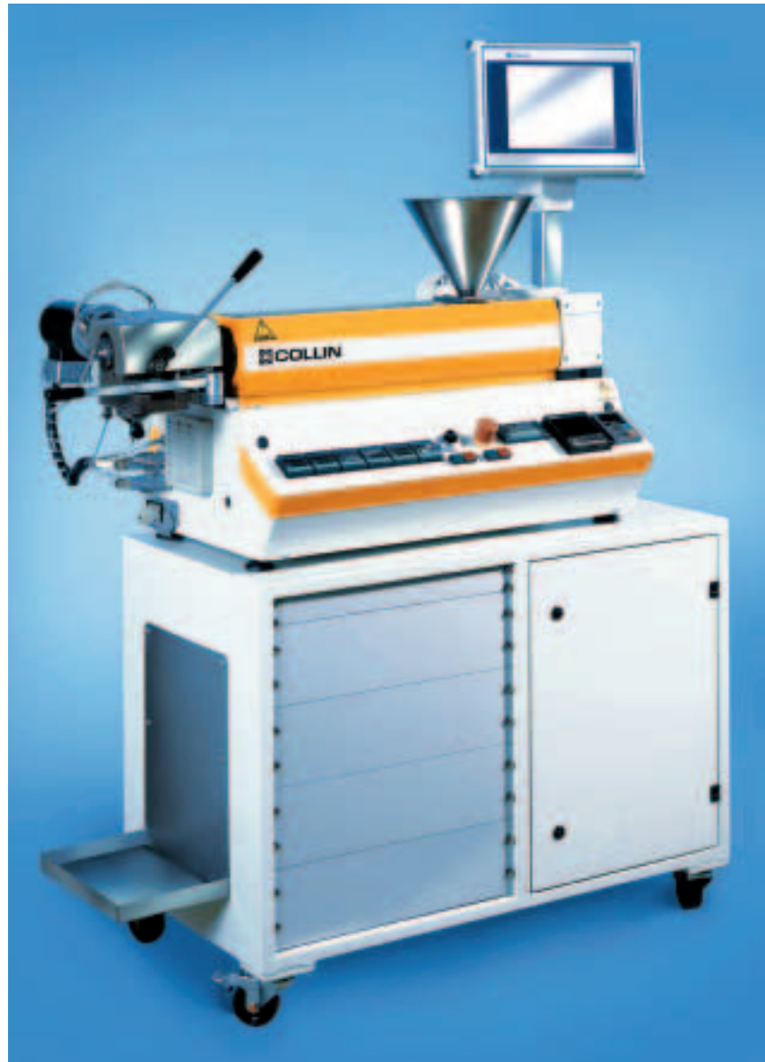
Technical modifications reserved

For a simplified testing method of experimentation a variant without a melt pump is available. The functions of the integrated screen changer are still the same.